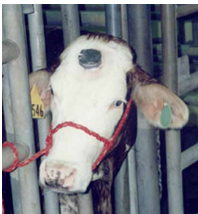
Heifer with cerebroventricle cannula for measuring central concentrations of leptin and NPY