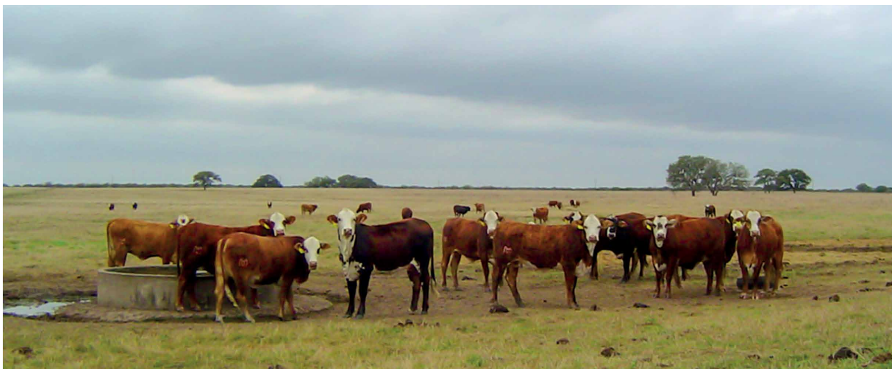
Yearling beef heifers at Texas A&M AgriLife Research Station, Beeville, TX

‘Much of the work we do has implications not only for livestock production but also in the human biomedical field. If we can understand the nutritional and developmental mechanisms that underlie the development of precocious puberty, methods can be developed to achieve puberty in heifers that is neither too early nor too late and avoid or minimise the occurrence of precocious puberty in girls.’